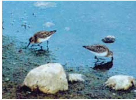
Shorebirds visit each summer.

Today the remains of this original post are still intact and are maintained by the RCMP each year. Weather permitting, a local outfitter/guide can provide a tour to visit historic Cape Fullerton. The boat trip can take four to six hours (depending on weather conditions), and visitors often prefer to camp there overnight before returning to Chesterfield.