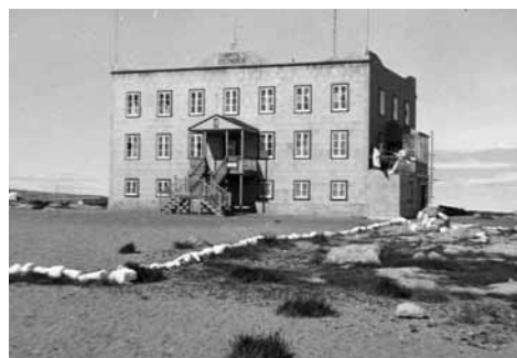
St. Theresa's Hospital, 1944.

A historical walking tour starts at the Northern Store (formerly the Hudson's Bay Company), the oldest building in the community. Part of the store was one of the original buildings put up in 1911.